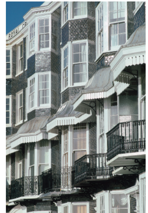
Royal Crescent, Marine Parade.