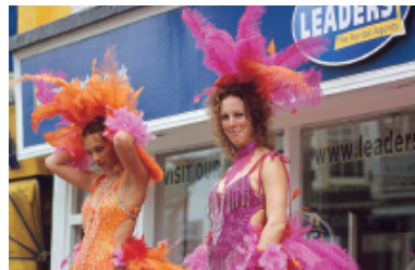
The Brighton Festival.