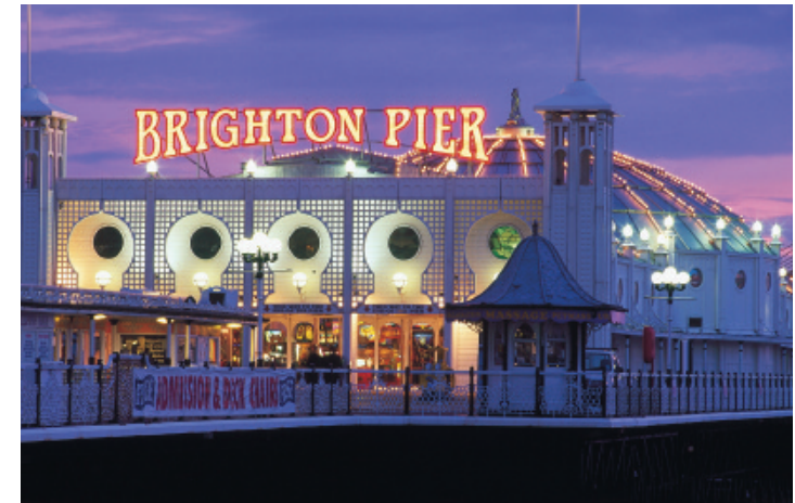
Brighton Pier at dusk.